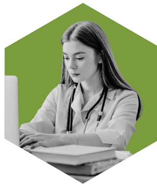
LIVE VIRTUAL EDUCATION